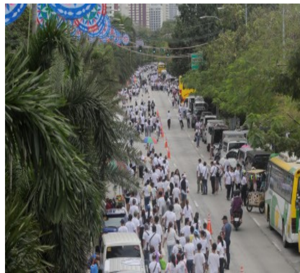
Iglesia Ni Cristo members walk along Roxas Boulevard in Manila for the National Rally for Peace on Jan. 13, 2025.

Attendees were also urged to observe traffic regulations, cooperate with security personnel, and participate responsibly. (PNA)