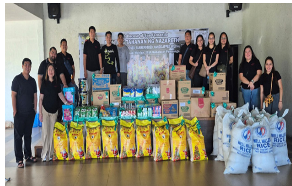
Munting Tahanan ng Nazareth