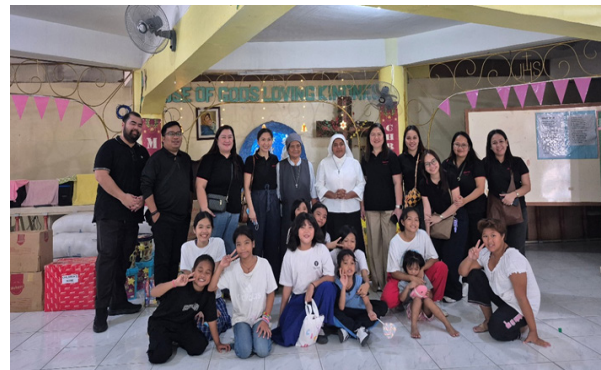
Children's Home of Eucharistic Love and Kindness

For over three decades, Mekeni has remained steadfast in its mission to uplift lives and nurture a culture of compassion. Through initiatives like this, the company continues to prove that true success is best measured by the positive change it inspires in others.