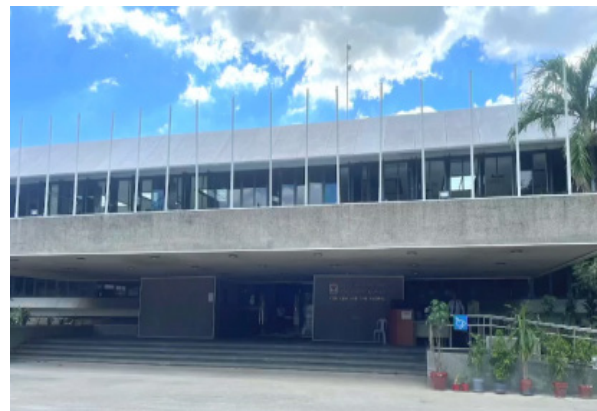
SOCIAL WORK DEV'T. The newly refurbished Department of Social Welfare and Development Academy in an undated photo. The DSWD is strengthening the skills and professionalism of social workers through the academy, which now offers comprehensive competency-based learning courses.