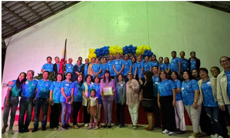
Six years of stories, service, and standing for truth. Happy 6th Anniversary, PAPER.PH! Honored to witness this milestone with a community that values honest reporting and meaningful storytelling. Cheers to the dedication, passion, and integrity that continue to inspire the industry.