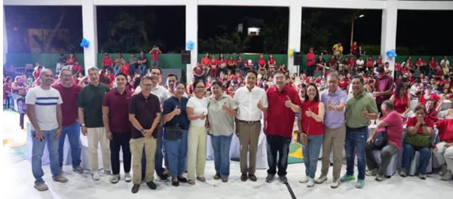
Salamat sa masayang 'Year-End Get Together,' Barangay Merville Ibang klase ang samahan at tawanan kasama ang ating mga kapwa-barangay nitong Linggo (Dec. 14). Salamat sa masayang hapunan, kwentuhan, at sa pagpapaalala na ang tunay na lakas ng Parañaque ay nasa pagkakaiba natin. Isang karangalan ang makasama kayo sa selebrasyong ito. Dala natin ang init ng Paskong ito tungo sa mas maunlad na Bagong Taon! #SaDiyosSaTaoSerbisyonTotoo #sErbisyoLangpo #BagongParanaque