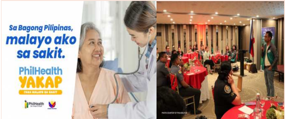
TACLOBAN CITY (PIA) — To bring preventive healthcare closer to Filipino families, the Philippine Health Insurance Corporation (PhilHealth) in Eastern Visayas has tapped government information officers and communicators to broaden the Yaman ng Kalusugan Program (YAKAP), the agency's expanded primary care benefit package.