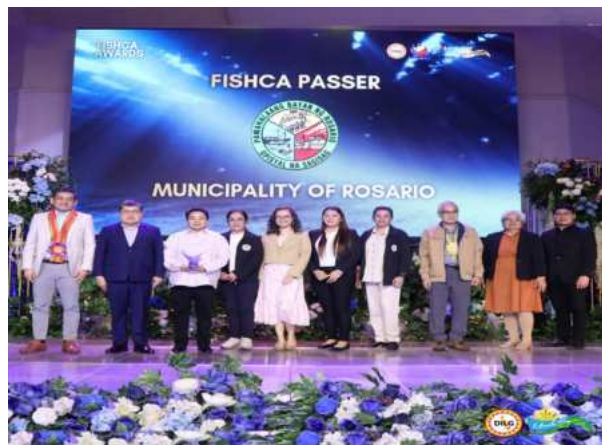
277 Taon ng Tapang, Sakripisyo, at Pagkakaisa

Isang karangalang muling maitala ang ating bayan sa mga nagtataguyod ng responsableng pangisdaan at pangangalaga ng kalikasan. #JusttoVerosario #Bay-AngtahimikMasayaatMaunlad