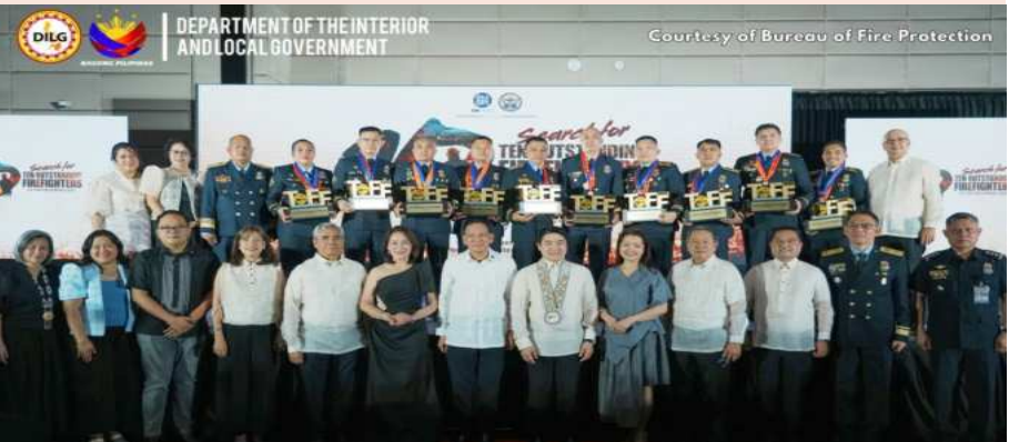
The Department of the Interior and Local Government (DILG) on Thursday placed a sharp spotlight on fire safety as a core pillar of public protection, honoring the country's finest firefighters during the Ten Outstanding Firefighters of the Philippines 2025 awarding ceremony at SMX Aura in Taguig City.