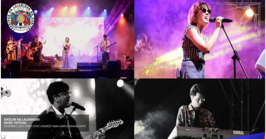
The Caviteño youth lit up the CvSU Main Campus in Indang on December 5, as thousands of scholars came together for the Iskolar ng Lalawigan ng Cavite Music Festival – a vibrant celebration of talent, youth empowerment, and the Provincial Government of Cavite's unwavering support to education.