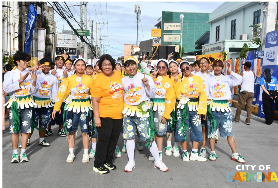
20TH ANNIVERSARY OF DIRECT ACCESS TO HEALTHY LIFESTYLE INTERVENTION AND ADVOCACY (D.A.H.L.I.A.) Matagumpay at masayang ipinagdiwang ang ika-20 taong anibersaryo ng Direct Access to Healthy Lifestyle Intervention and Advocacy (D.A.H.L.I.A.) na may temang "2DBFF, 2 Decades of Blooming Friendship and Fitness." Isinagawa ito sa pangunguna ng Office of the City Health Officer bilang bahagi ng pagdiriwang ng 3rd Cityhood Anniversary at 169th Founding Anniversary ng Carmona. Daan-daang healthy lifestyle enthusiasts mula sa iba't ibang barangay, paaralan, at sa-mahan ang nakiisa at nakisayaw sa street aerobics competition na kanilang pinaghandaan, mula sa kasuotan hanggang sa performance. Taos-pusong pasasalamat ang ipinaabot sa lahat ng nakiisa at tumangkilik sa makabuluhang programang ito na naglalayong mapabatid ang kahalagahan ng healthy lifestyle sa bawat mamamayan.