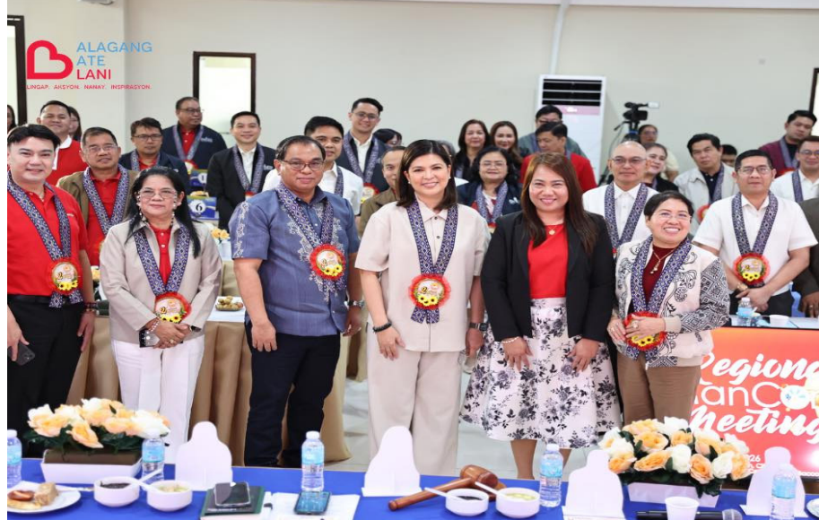
Isang makabuluhang talakayan ang naganap sa Regional Management Committee Meeting ng Department of Education CALABARZON kas ma ang Regional Director, Assistant Regional Director, Regional Chiefs, Schools Division Superintendents, at education managers ng rehiyon. Patuloy na isinusulong ang mga panukalang batas para sa kapakanan ng mga mag-aaral at guro, mula sa pagpapalawak ng National Feeding Program hanggang sa Parent-Teacher and Community Association Act at National Student Allowance, upang matiyak na walang batang maiiwan. Ibinahagi rin ang kahalagahan ng Republic Act No. 12073 o Bacoor Assembly of 1898 Act upang maipakita ang mas buong larawan ng kasaysayan at mapukaw ang diwang makabayan sa bawat kabataang Pilipino. Sa gitna ng mga hamon, nananatili ang paninindigan na magsama-sama at magtulungan para sa kinabukasan ng Kabataang Bacooreno.