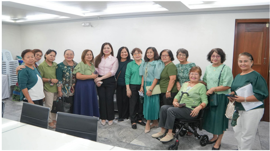
OATH-TAKING OF THE RETIRED TEACHERS ASSOCIATION. The oath-taking of the Retired Teachers Association was held yesterday at the Office of the City Mayor, highlighting the commitment to continued collaboration in promoting education and public service.