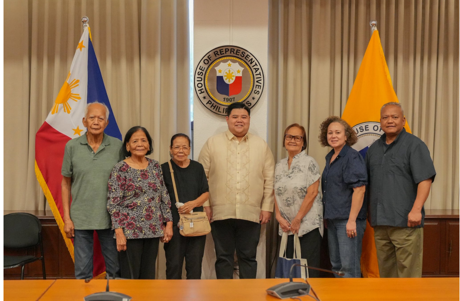
A PRODUCTIVE WEDNESDAY! Present ang inyong lingkod sa plenary session ng House of Representatives of the Philippines kung saan ipinagpatuloy ang pagdingin sa mga panukalang batas na isinusulong kasama ang mga kapwa mambabatas. Nagpahayag din ng pasasalamat sa patuloy na pagkakataong katawanin ang mga mamamayan ng Third District of Cavite. Sinisiguro na walang nasasayang na araw sa paglilingkod—para sa Pilipino at para sa bawat Imuseño.