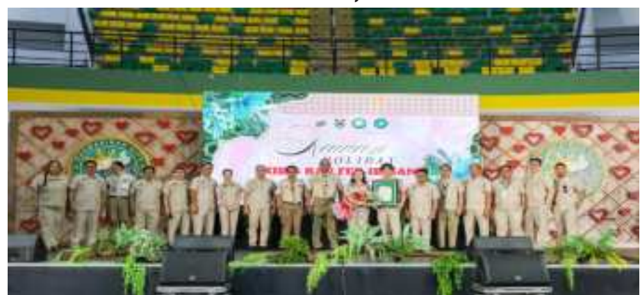
Awarding of Permit to Operate of the Boy Scouts of the Philippines (BSP) Dasmariñas Associate Council during the KID and KAB FEB-ibigan (KAWAN Holiday) held at City of Dasmariñas Arena.