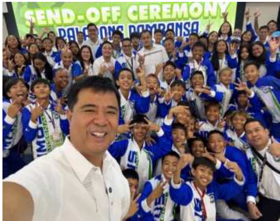
Nagbahagi ng isang masayang selfie kasama ang mga atletang Imuseño na inaasahang magiging susunod na kampeon sa Palarong Pambansa 2026. Nagpaabot din ng suporta at pagtati para sa Imus Arsenal at sa lahat ng atletang patuloy na nagbibigay karangalan sa lungsod sa larangan ng palakasan.